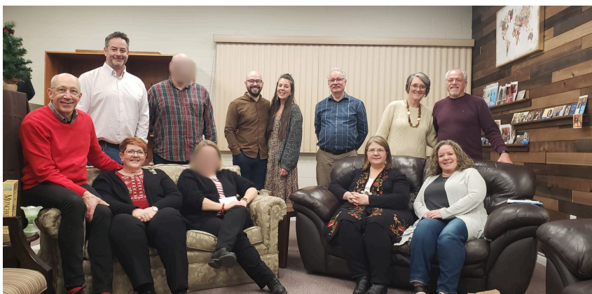
Due to the nature of what some of our staff do, they are unable to have their photos share here.

This fund also helps us develop new programs and workshops to encourage and equip the local church as they send out their people into God's harvest field. We would not be able to step into the area of training without the financial resources to do so.